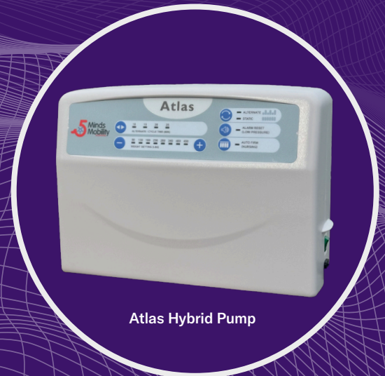
Atlas Hybrid Pump